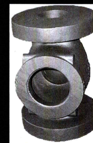
M.A. Steel Foundry