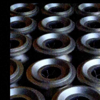
Midland Manufacturing Co.