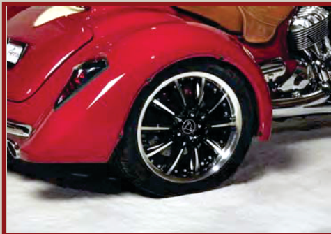
Removable Fender Skirts