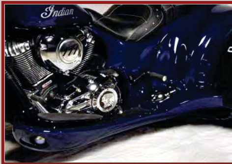
Optional Ground Effects

Introducing the CSC Arrow, designed specifically for Indian Motorcycle Chief models with the iconic styling that California Sidecar is known for. Our Arrow trikes feature industry first ground effects and removeable fender skirts, along with a host of carefully crafted options to personalize your Indian. Our kit mounts to your Indian tourbox or ours, or you can go without for that beach cruiser look and still have 6.2 cu ft of trunk space for your cargo.