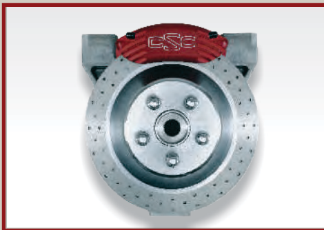
Optional Performance Brake Upgrade