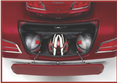
8 cu ft of Trunk Storage Capacity

The all new VIPER has been designed exclusively for the new 2012 Honda Goldwing 1800. CSC has captured Honda's new styling changes and incorporated new LED tail lights that are a perfect match to the Goldwing tour box lights. We have also accented the trunk door with an LED spoiler light that is both a running light and a brake light for greater visibility. This new door offers easy access to the largest storage area of any trike in the industry - 8 cubic feet.