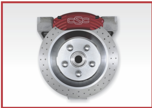
Performance Brake Upgrade