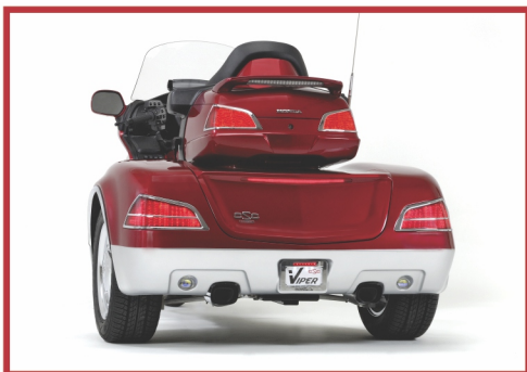
Optional Chrome Tail Light Trim