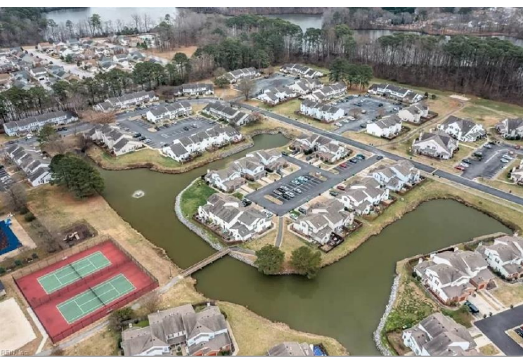
Aerial Photo of a portion of Smithy Glen