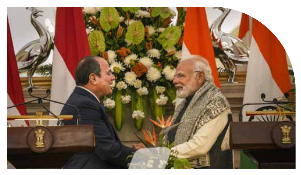
Prime Minister Narendra Modi with Egyptian President Abdel Fattah El-Sisi during their joint statement after a meeting at Hyderabad House in New Delhi on 25 January, 2023

"India has invited Egypt as a special guest for the G-20 summit which shows our age old relationship. We have decided that under the India-Egypt strategic partnership, we will create a long term structure of cooperation on political, security, economic, and scientific areas," said Prime Minister