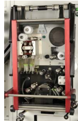
Newly designed wet head significantly reduces or eliminates "bubbles".