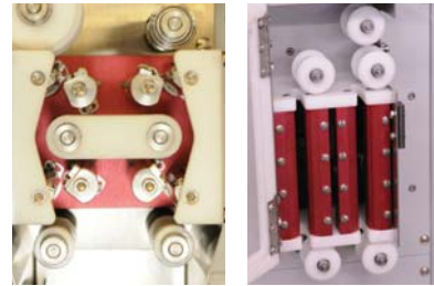
New air knives and advanced film drying system ensure reliable drying at much higher speeds than previously possible.