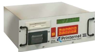
NEW! Printernet III Computer Printer Control System allows scene data files from film color grading equipment to be downloaded directly from a server or PC.

CONTACT US FOR DETAILED SPECIFICATIONS AND A PRICE QUOTATION