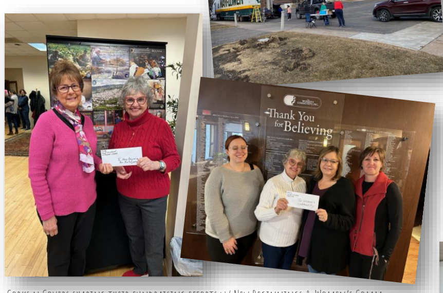
CORKS IN COVERS SHARING THEIR FUNDRAISING EFFORTS W/ NEW BEGINNINGS & WOMEN'S COMM.