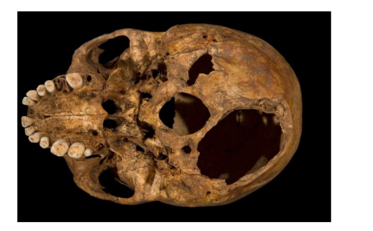
An examination of Richard's remains shows a deep cut beneath chin that is consistent with this cutting or slicing action.

These show the death blow to skull and this was a slicing blow directed at the head.