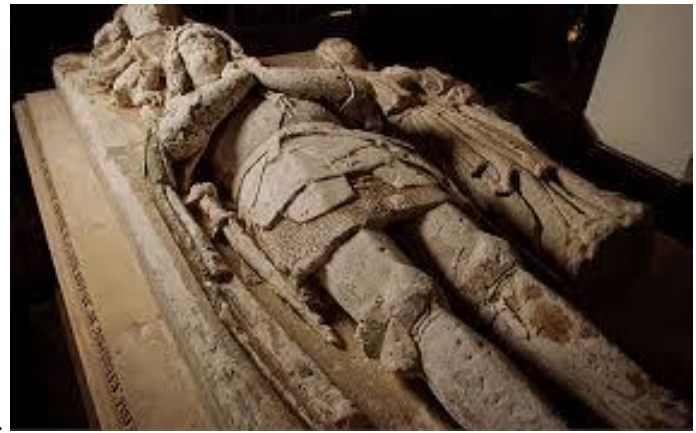
Tomb in St. Peter's Church Carmarthen

After Henry VIII suppressed the monasteries, Rhys' tomb was moved to safety at St. Peter's Church which is also in Carmarthen. The tomb was moved to that location in order that it would not be destroyed during Henry VIII's Dissolution of the Monasteries in the 1530s. Sir Rhys' tomb can still be seen at St Peter's Church to this day and those who have seen it will testify to the fact that it is a very fine resting place for this famous and successful Welsh knight.