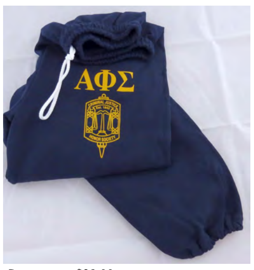
Sweat pants $29.00 Navy. Elastic cuff. Drawstring