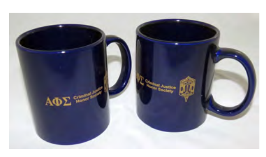
Cobalt blue cup $9.00