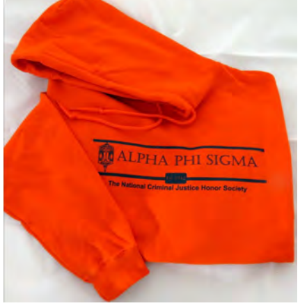
Hooded sweatshirt with pockets $34.00 Available in crimson and orange