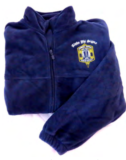
Fleece zipped jacket $44.00 (2XL $48) Navy. Embroidered. Zipped pockets High neck