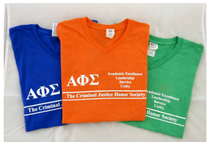
V-neck t-shirts $18.00 Heather green, heather orange, blue