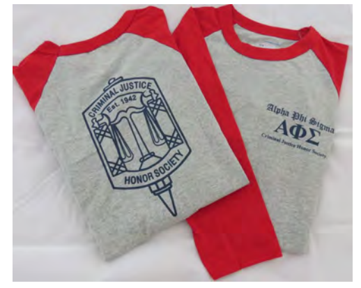
Baseball T-shirts, printed front & back $27.00 Heather/red or light blue/dark blue