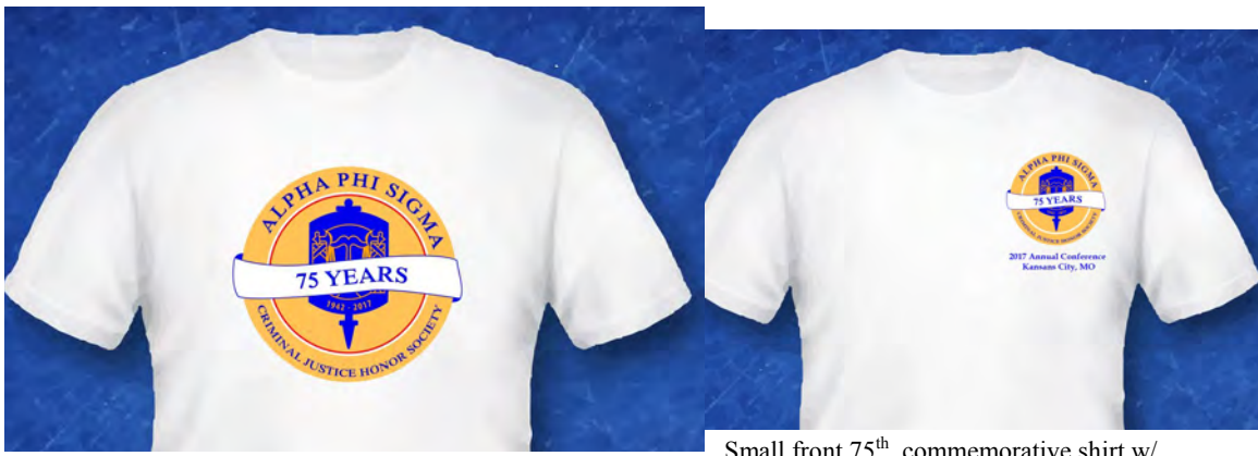
Front Large 75<sup>th</sup> 3-color Design $15