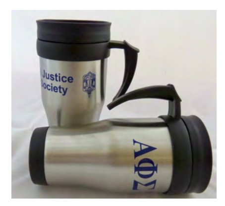
Stainless travel mug $14.00 Wrap around text