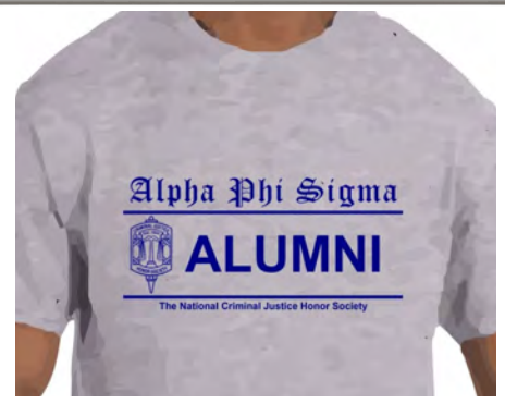
Alumni T-shirt—heather gray. $14.00