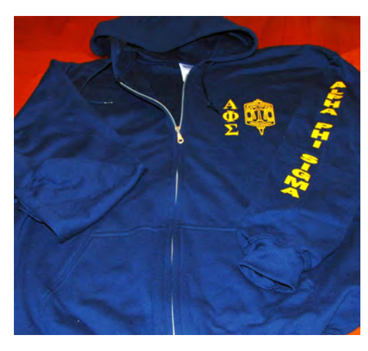
Zipped hoodie $42.00 (2XL $48) Dark blue/navy. Printed front and sleeve