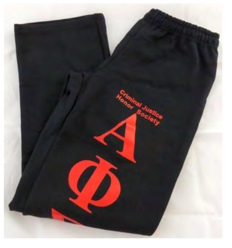
Sweat pants $29.00 Black. No cuff. Drawstring