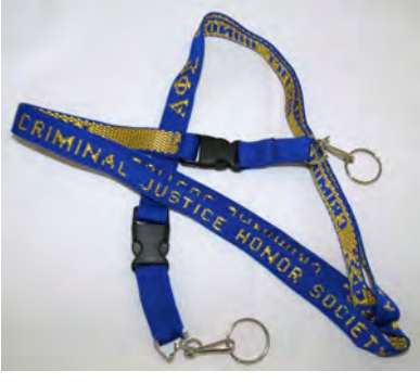
Lanyard $9.00 Blue with gold lettering