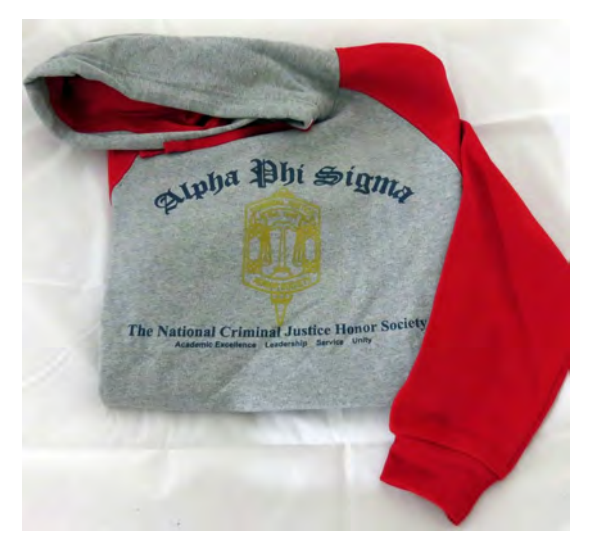
Two color hooded sweatshirt with pockets $36.00 Available in heather/navy & heather/red