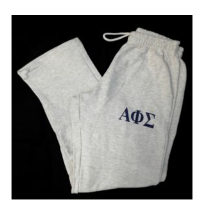
Straight leg sweat pants. Heather gray