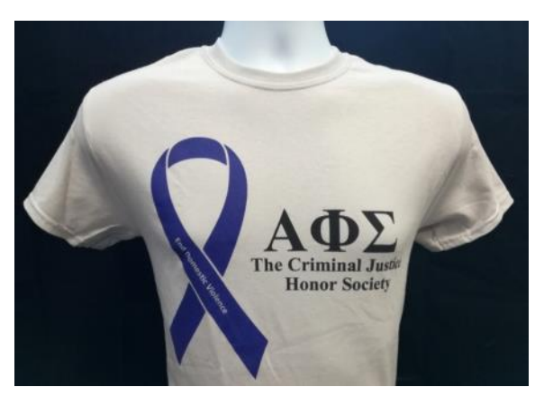
End Domestic Violence T-shirt. Light Gray