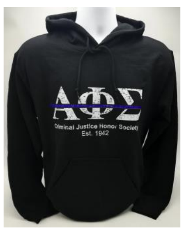
Black Thin Blue Line Hoodie