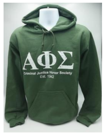
Distressed Greek Lettering Military Green Hoodie