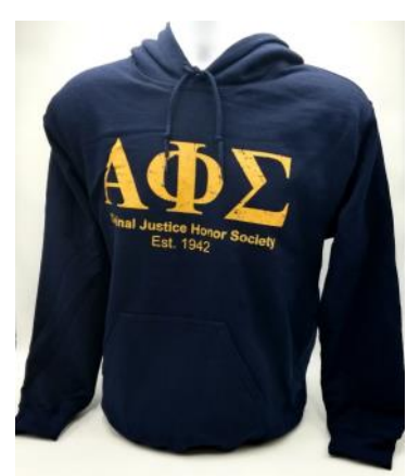
Navy Hoodie with Distressed Greek Letters