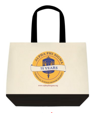
Canvas tote bag. $20. NOW $15