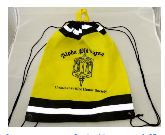
Large non-woven reflective hit sports pack $7