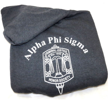
Zipper hoodie jacket in white, navy, and grey. Large Alpha Phi Sigma with Key on the back. $42