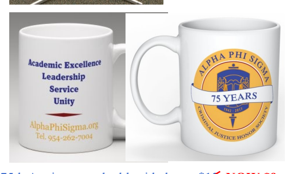
75th Anniversary double sided cup. $12 NOW $9