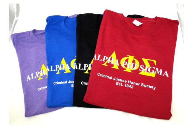
Unisex, Lightweight T-shirts in assorted colors $14