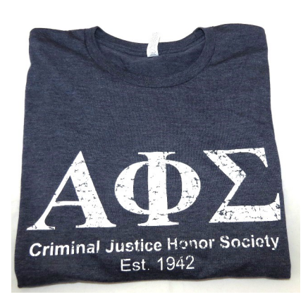
Distressed print t-shirt in soft lightweight cotton. Heather mi-navy with white distressed letters. $15