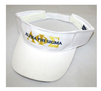
Cotton twill visor. $10