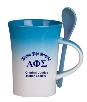
ADS Criminal Justice Honor Society