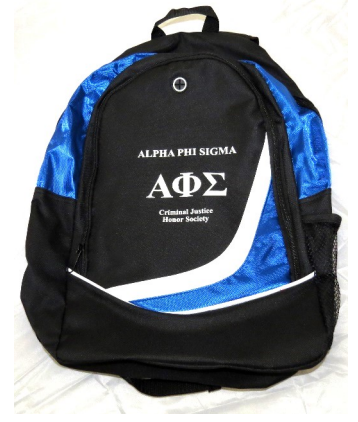
Backpack with side mesh water bottle holders, 2 pockets and earbud holder $22