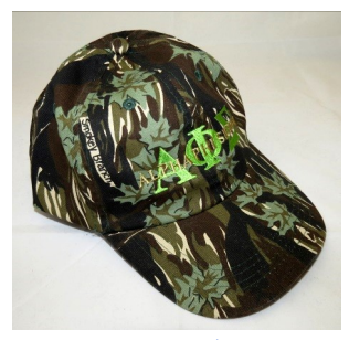
Camo cap. $12