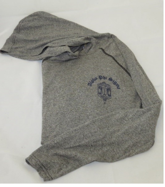
Unisex mock twist raglan hoodie. Available Indigo and Heather Gray. $28