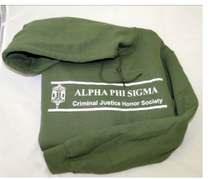
Hooded sweatshirt with pockets $32. Available in Orange, Dark Chocolate, Royal Blue, Military Green, and Garnet