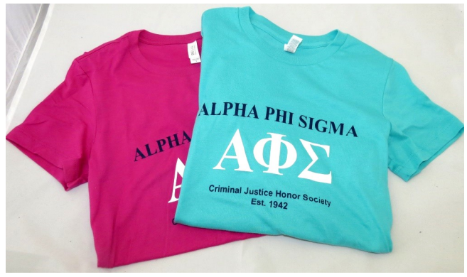
Ladies' T-shirts in Pink and Teal in soft light cotton $14