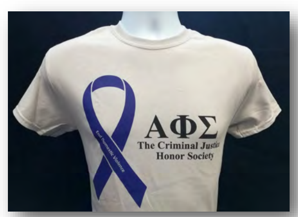
End Domestic Violence T-shirt. Light Gray