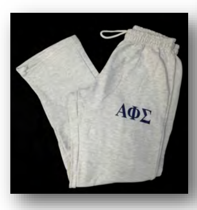
Straight leg sweat pants. Heather gray