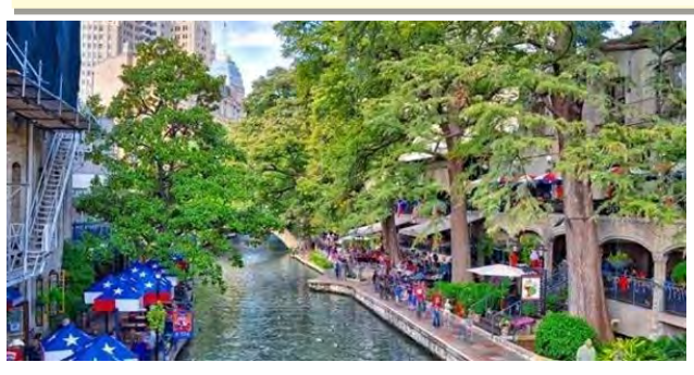
San Antonio Marriott Rivercenter Hotel 101 Bowie Street, San Antonio, Texas 78205