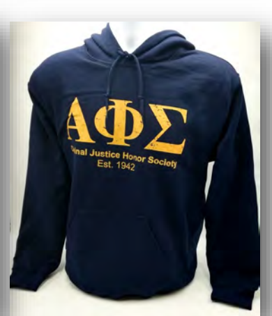
Navy Hoodie with Distressed Greek Letters