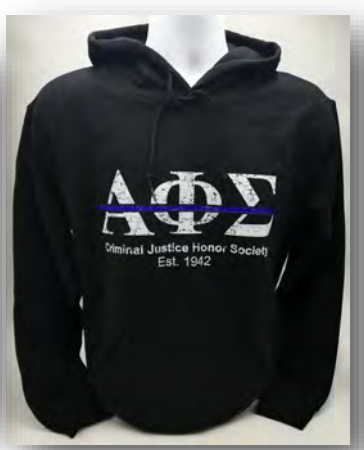
Black Thin Blue Line Hoodie