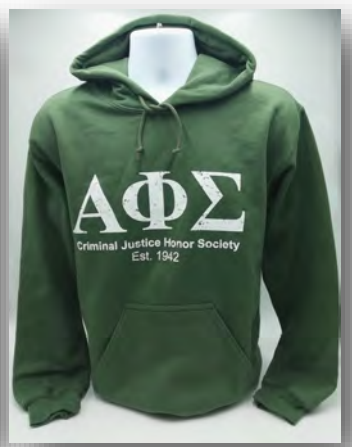
Distressed Greek Lettering Military Green Hoodie