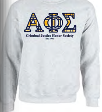
Applique Sweat Shirt Grey or Navy