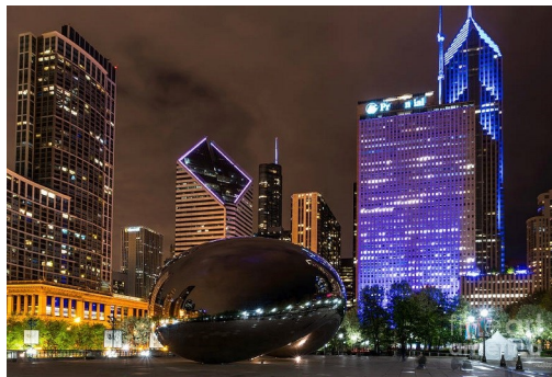
Hilton Chicago 720 South Michigan Avenue, Chicago, IL 60605

Alpha Phi Sigma 2024 Annual Conference Chicago, Illinois March 20-22, 2024