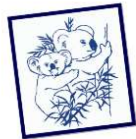
TLC Pediatric Dentistry & Orthodontics