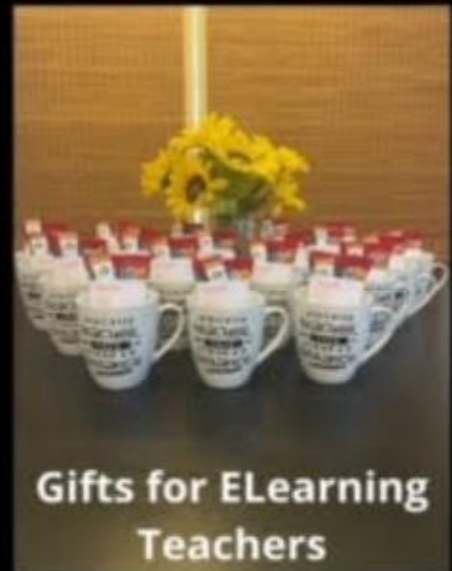
Gifts for ELearning Teachers