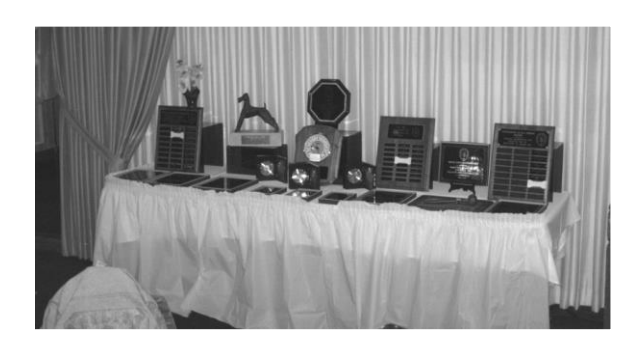
Just a few of the awards presented in past years