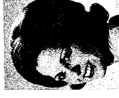
GWEN JACOBSEN Elk Horn Region 5