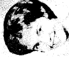
REBECCA HOSKINSON Grand Junction Region 6