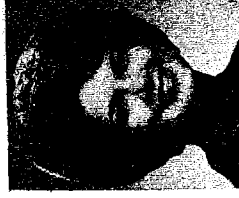
DEANNE ESTLE Letts Region 7