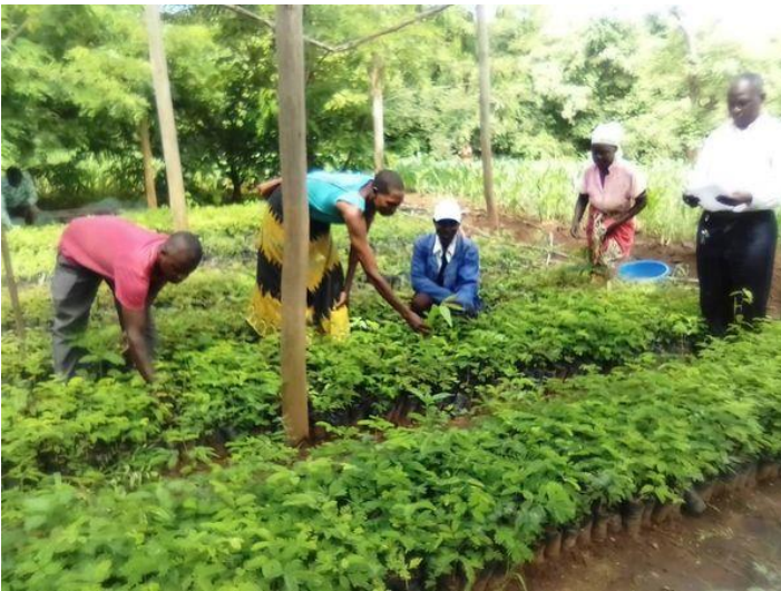
Above right: (June/July 2022 Home based care evaluation took place as food prices soared.