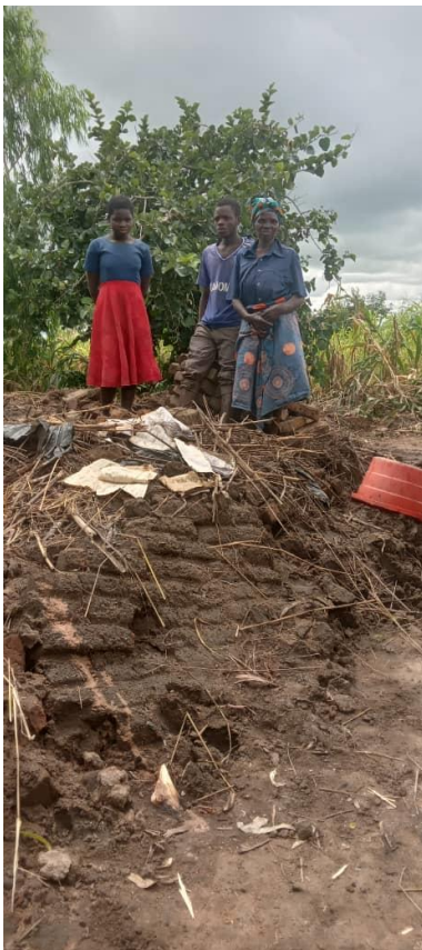
Cyclone Survivors March 2023