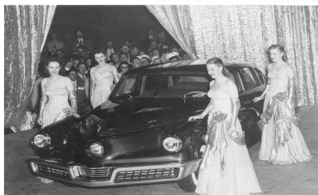
1948 Tucker press preview