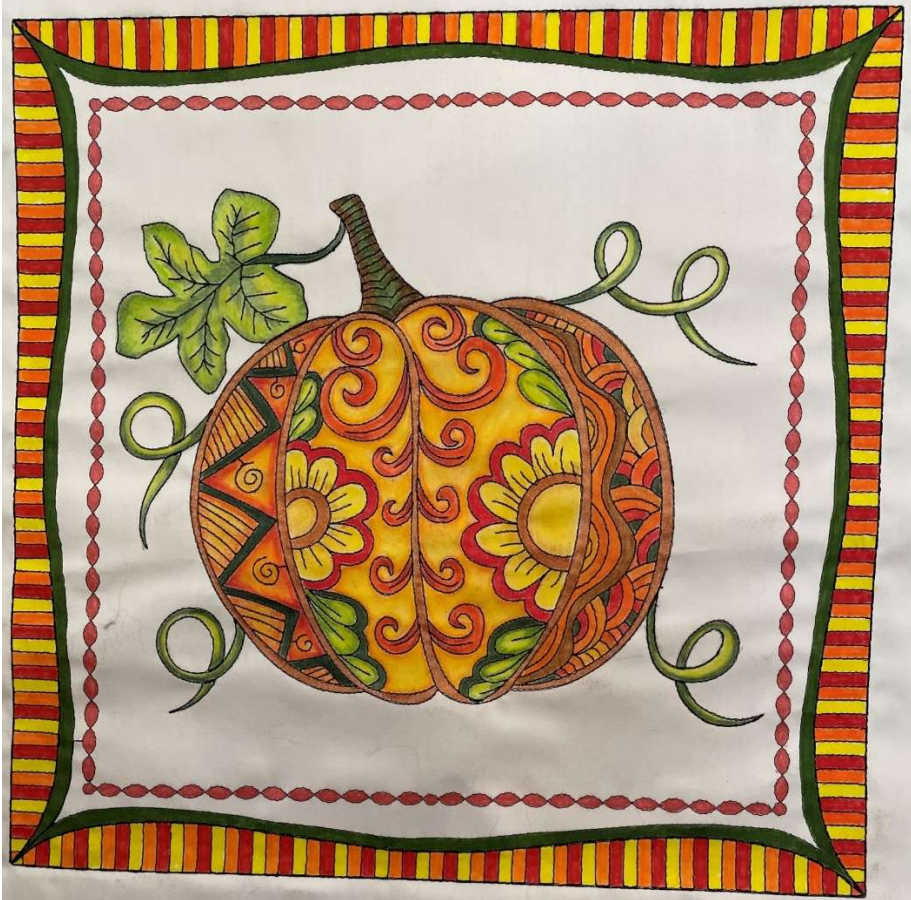
Sunflower Pumpkin with Frame