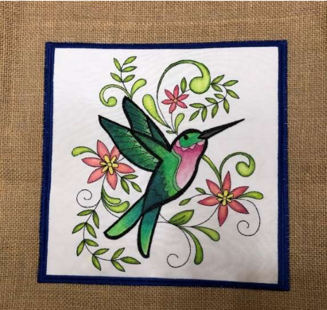
Hummingbird with Small Flowers - $45.00