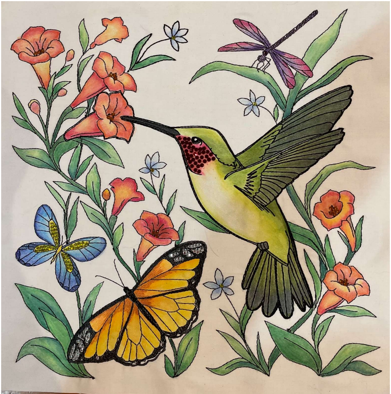
Ruby Throated Hummingbird with Florals, Butterflies and Dragonfly - $60.00