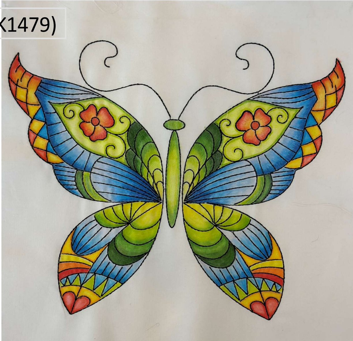
Butterfly 2 (KK1479)