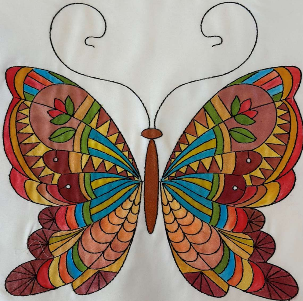
Butterfly 7 (KK1481)