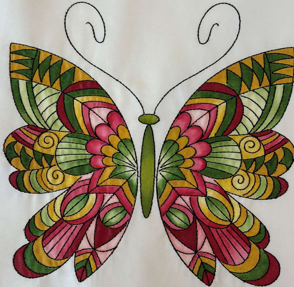
Butterfly 9 (KK1478)