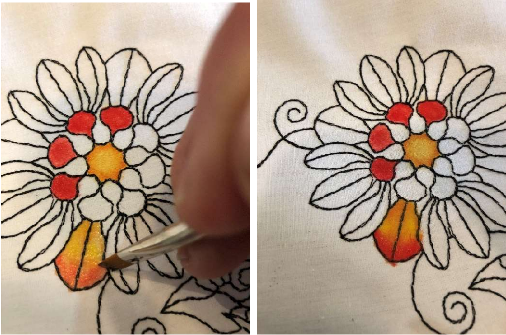
While petal is still wet you can add color depending on what you want then blend again with wet brush. Notice the color outside the lines... that can be fixed by allowing the area to dry then color over the mistake with a Gelly Roll white pen (aka a BooBoo pen).

One note about Inktense Ink... it also comes in blocks or sticks of pure color. Sometimes coloring a large area with a pencil is time consuming and awkward. You can use the blocks to produce a large quantity of paint by scraping part of the stick into a small paper cup that has some fabric medium in it. I find it is easier to mix in cups that have plastic lids so that I can save my paint for later use.