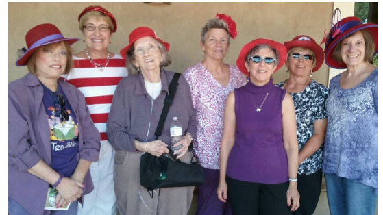
The Río Rancho Royal Rowdies came for a tour.