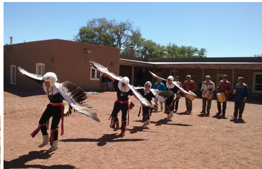
The Eagle Dance performed by the Riley family from the pueblo of Laguna