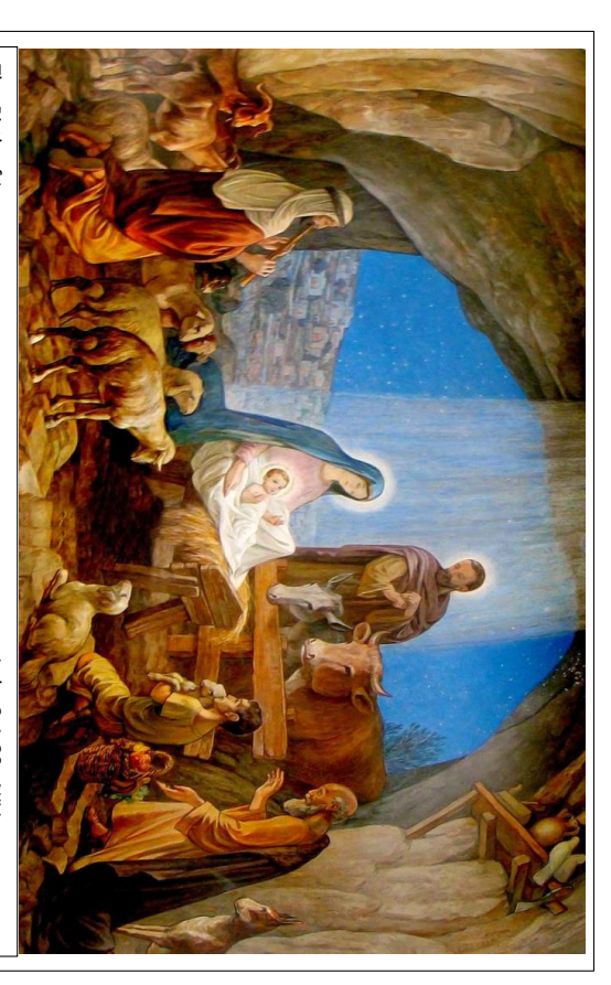
The Birth of Jesus