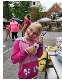
Photos from the Block Party May 22