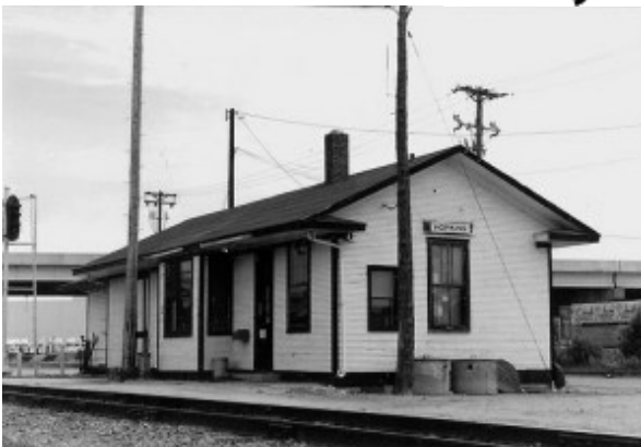
Hopkins train depot.