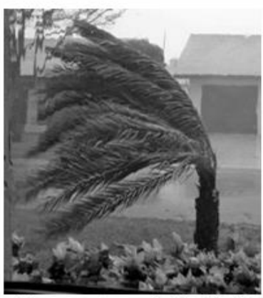
Meets or Exceeds Florida & Miami-Dade building codes

FACTORY DIRECT pricing for the highest quality windows and doors