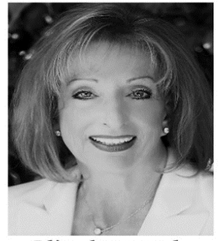
I live here and work here!