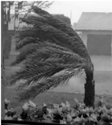
Meets or Exceeds Florida & Miami-Dade building codes

FACTORY DIRECT pricing for the highest quality windows and doors