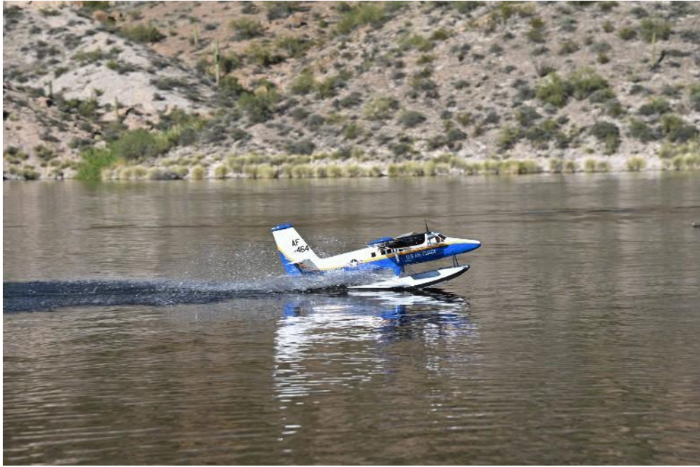
A gorgeous 82" Scale Twin Otter is a scale model of the UV-18 'Twin Otter' and the military version of the DeHavilland DHC-6 on takeoff plane.