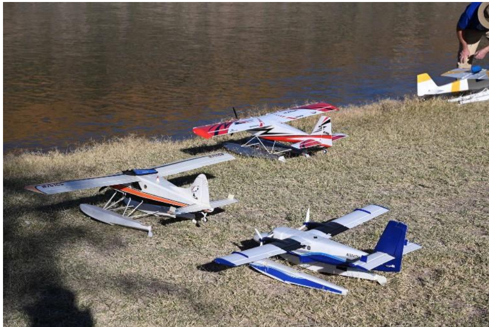
A few of the many, and I mean many air frames.