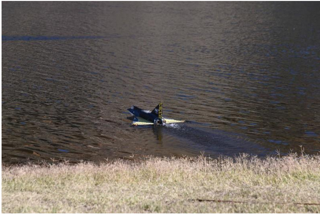
Above, Navy experimental delta wing jet, Convair F2Y Sea Dart.