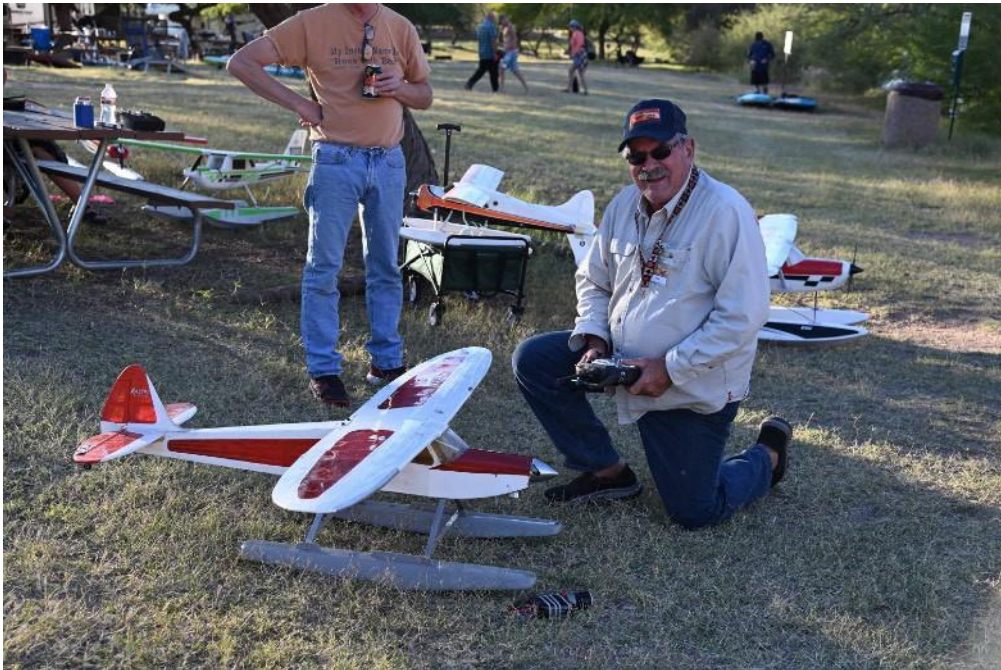
Above, a SIG Rascal on floats. A great flying plane!