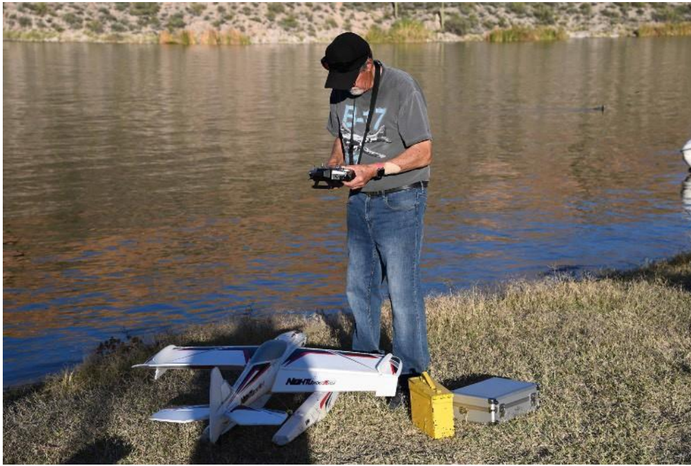
Final preparations before takeoff.