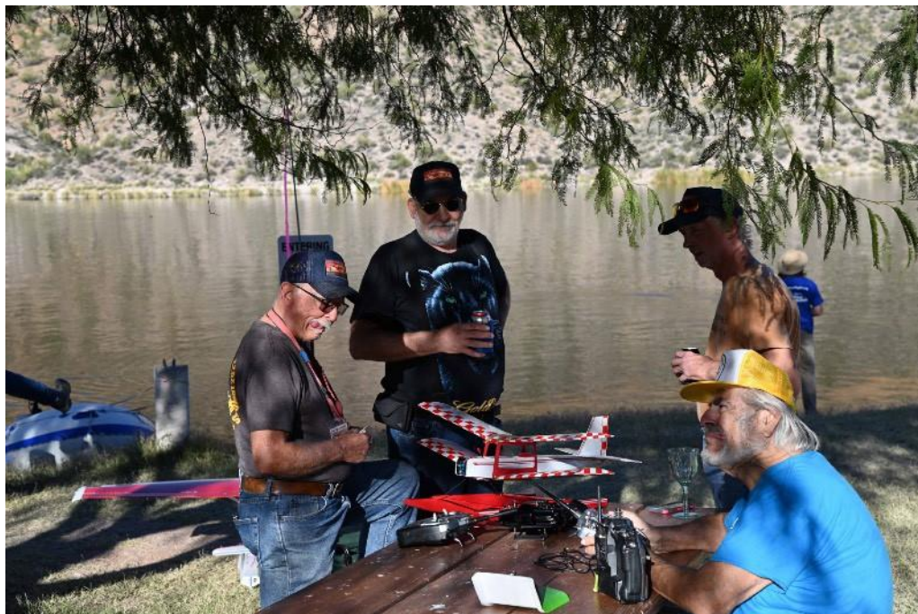
Great minds trying to determine if she will fly. ????? It did!