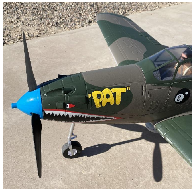
Right, this P-39 has all the panel lines and rivets in place. The name is super-cool, too.