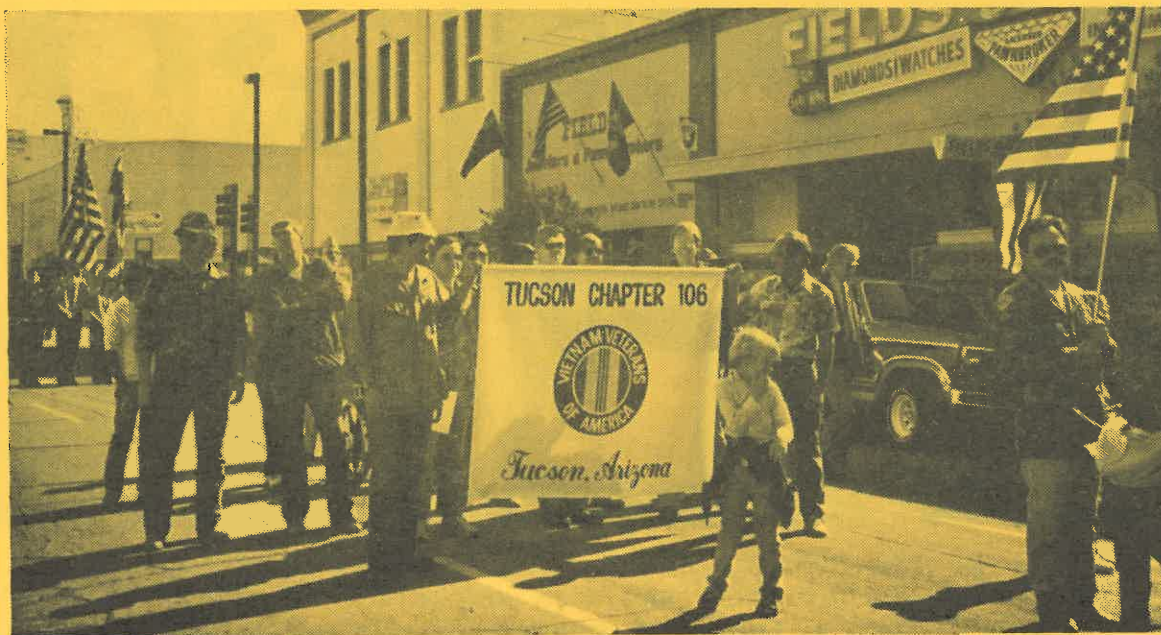
Veterans Day, November 11, 1986, VVA 106

7 November 73--Congress overrides President Nixon's veto of the War Powers Act.