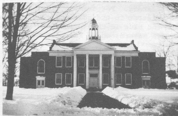
MAINE CENTRAL SCHOOL now J. Ralph Ingalls School