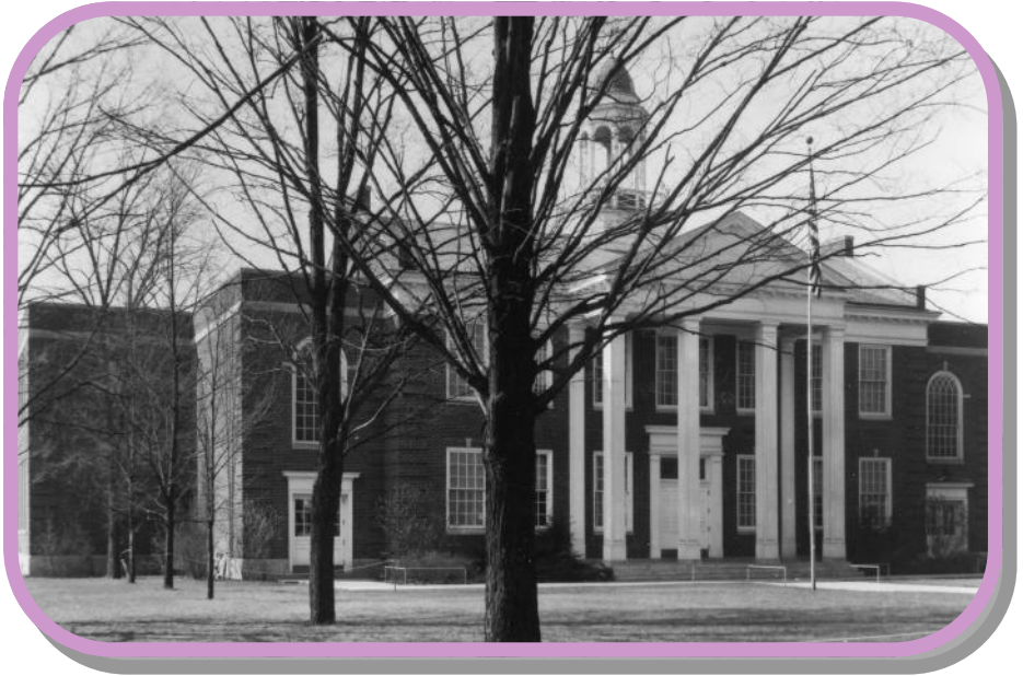
Maine Central School