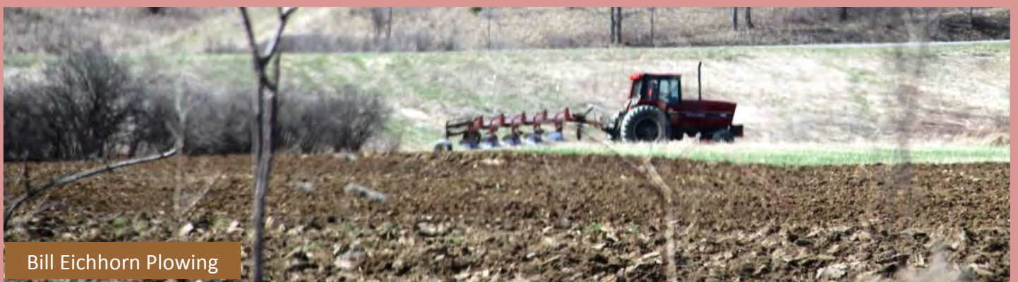
Bill Eichhorn Plowing

Memorial Day Monday May 28 after the parade work your way to 13 Nanticoke Road. We will have: tours of the Museum, and mill (10—3), Smokey Legend BBQ available (11— sold out), Bake sale. (10—3), Raffle Baskets. (10—3), and a very large sale inside the 1845 school house. (10—3). You will not be disappointed!