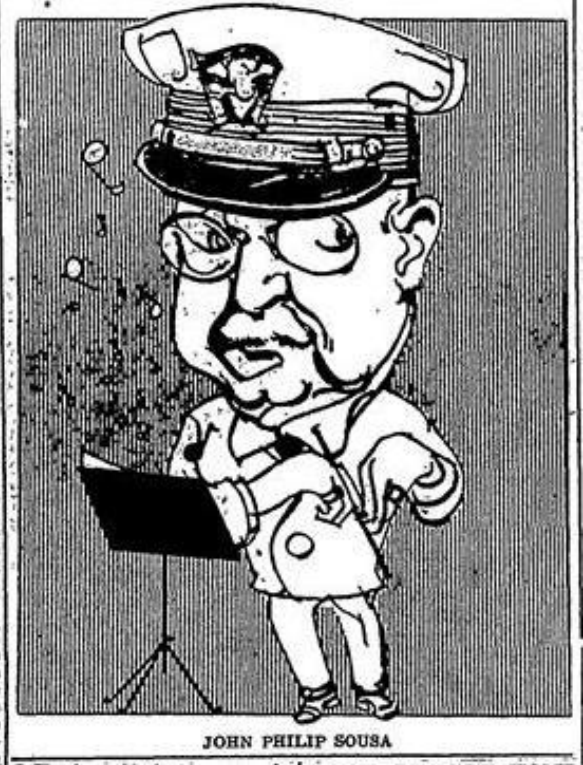
1931 Sousa band concert held in Endicott

The other historic marches which Sousa has written for his forthcoming tour are "Salvation Army", in commemoration of the 50th anniversary of the founding of that organization and "George Washington Bi-Centennial," written for the celebration of the 200th birthday of the Father of Our Country, to be observed in the National Capital in 1932. In addition to these marches Sousa has composed "The Harmonica Wizard", a march for boys' harmonica bands, of which there are about 20 in the country, and "Daughters of Texas", a march dedicated to the Texas State College for Women, located at Denison.