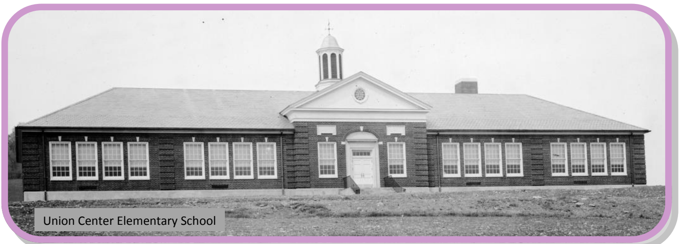
Union Center Elementary School