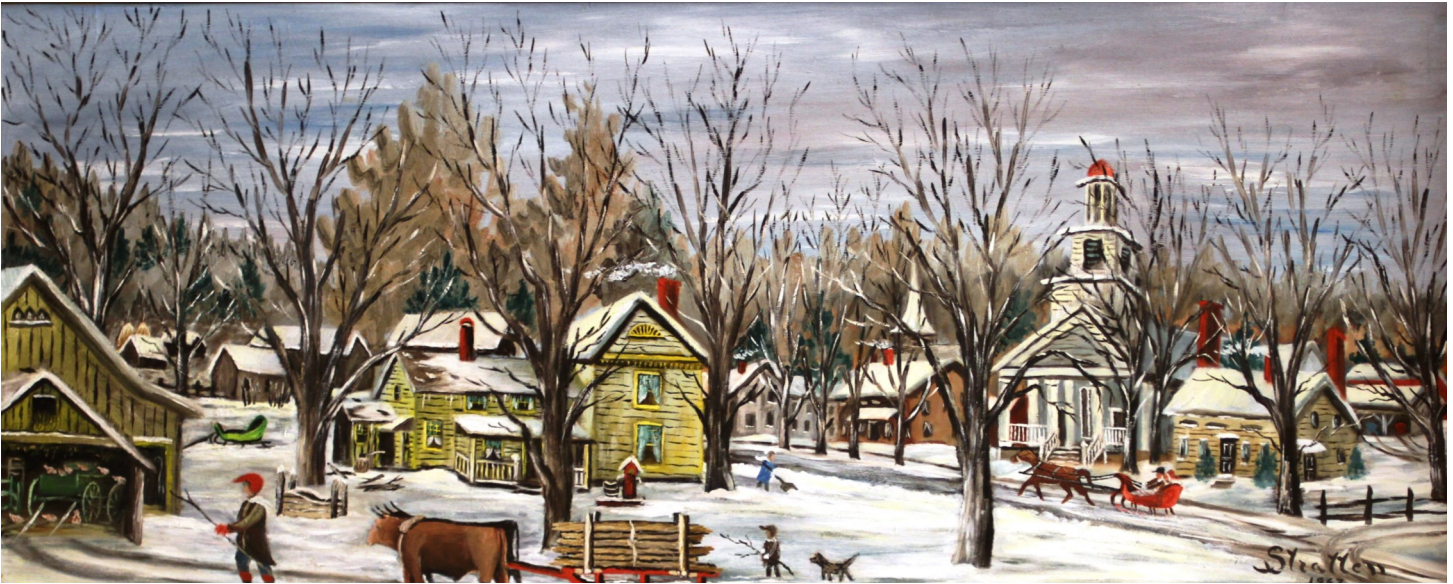
“A Winters Day in Maine, New York,” 1867, Maine and Lewis Street, 1967, painting # 220, (48” X 20 ¾”). Followed by a “Winters View” of some of our beautiful buildings.