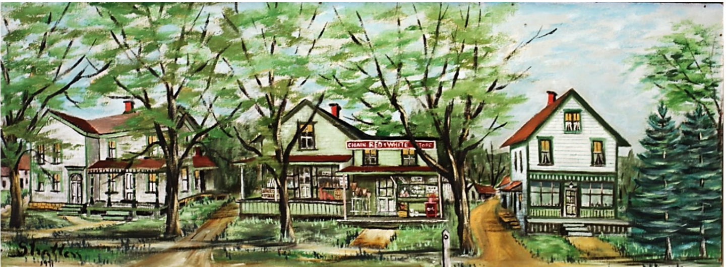
“Higgins Store in 1929,” 1971, (48” X 18”) located in Maine Memorial Elementary School auditorium. Current addresses on Main Street; 2631 circa 1880, 2633 circa 1929, 2635 circa 1903. Today the scene has changed but the buildings are still there.