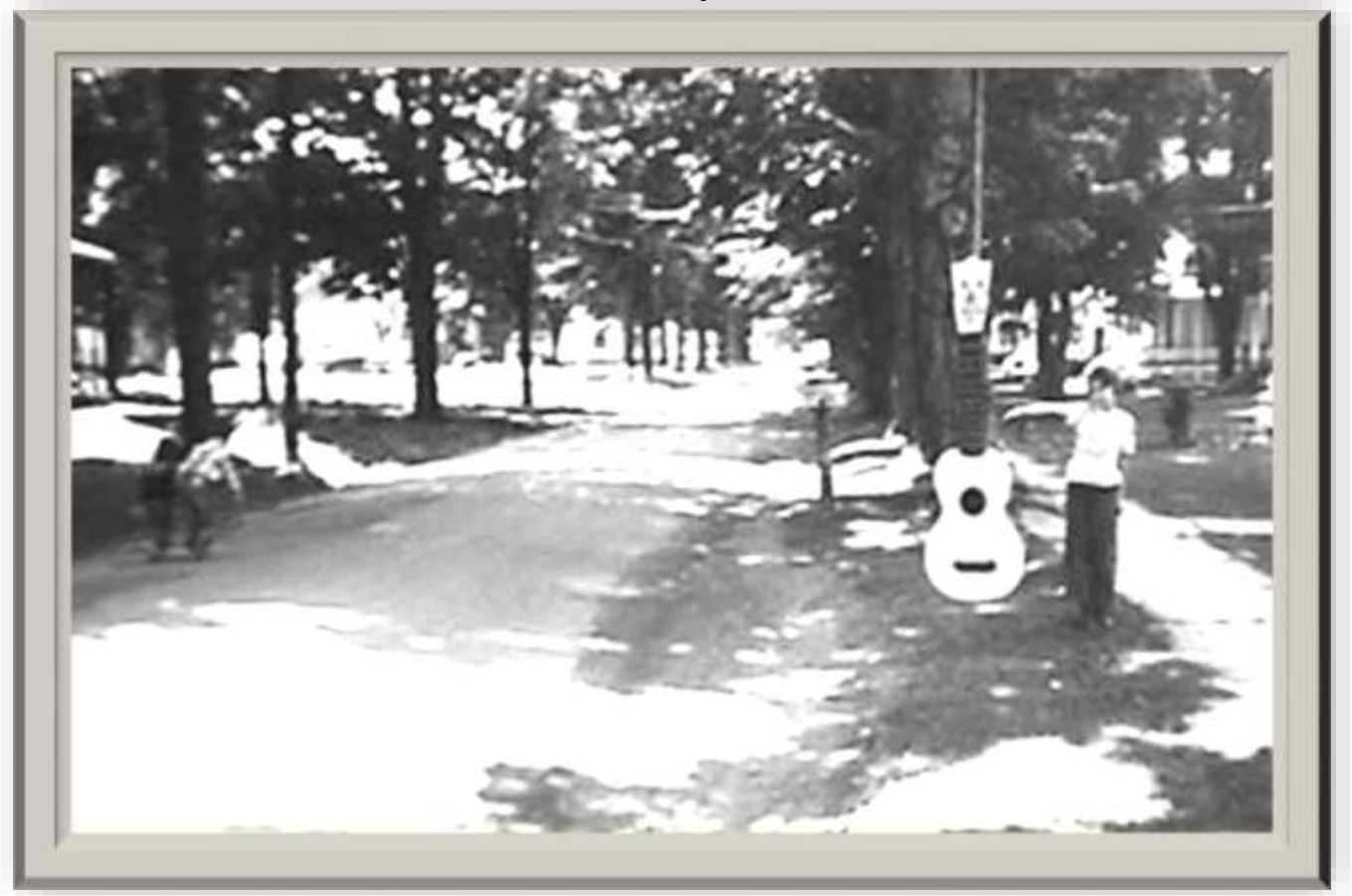
Lewis Street Maine NY Compare & Contrast 63 Years

Above May 1956—Below April 2019. Lewis Street "opened" around 1870 when the land was donated by the Lewis Family. The maple trees in 1956 were planted in 1870, not one maple remains today. View is looking towards the west. The maples on the south side of Lewis St in the church field were planted in the 1950's by the maine scouts