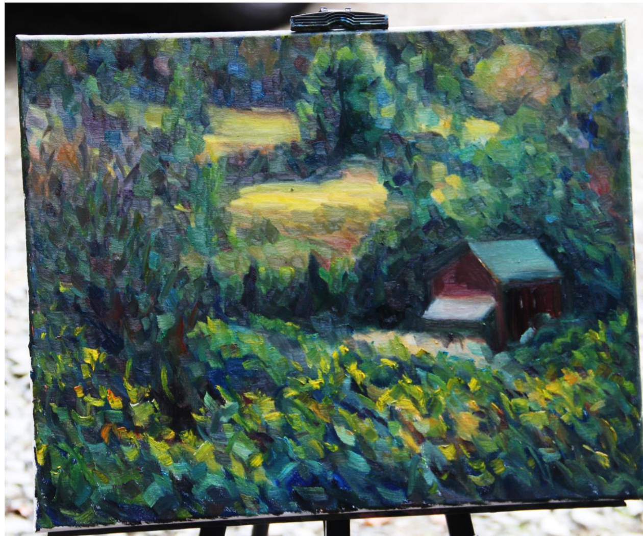
First Place view of Bridan Lane Hill