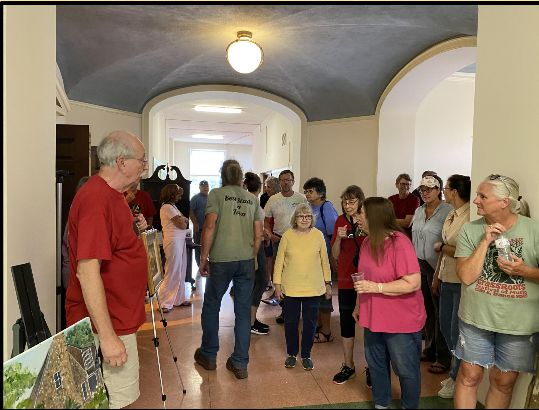
Exhibit held at the J. Ralph Ingalls building 35 Church Street Maine NY 9.9.2023