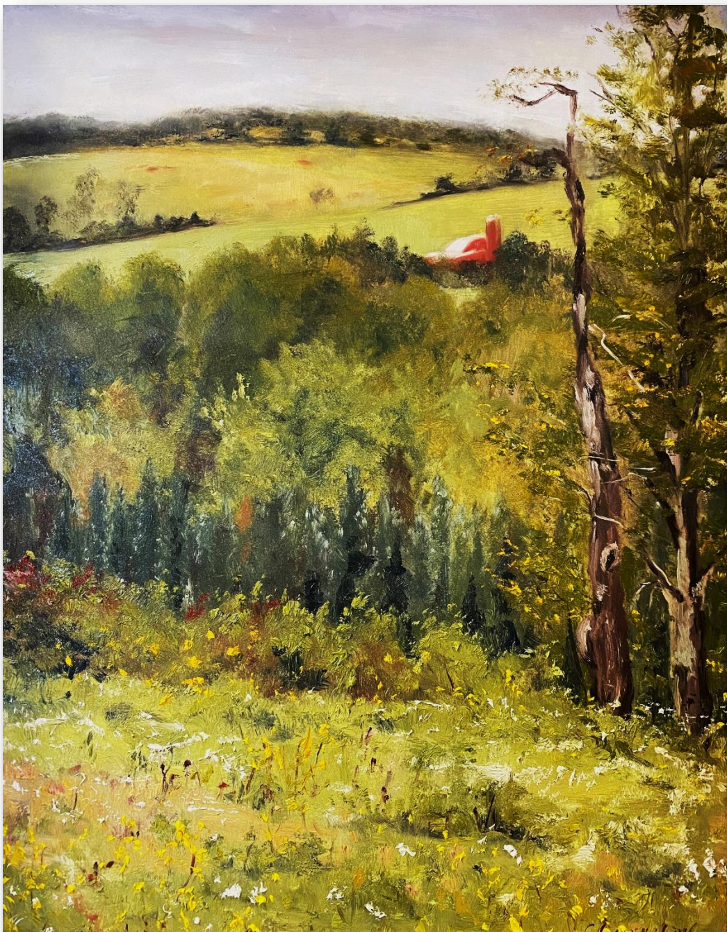
Christine Capriglione Honorable Mention View from Bailey Hollow Road