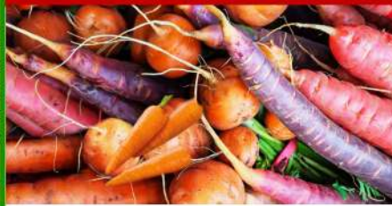
Root Vegetables Carrots, Beets, Radishes