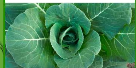
Greens Collard, Mustard, Turnip