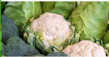
Cruciferous Vegetables Cabbage, Broccoli, Cauliflower