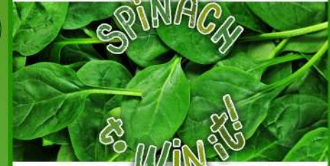
SPINACH & WIN IT! GEORGIA ORGANICS OCTOBER FARM TO SCHOOL MONTH