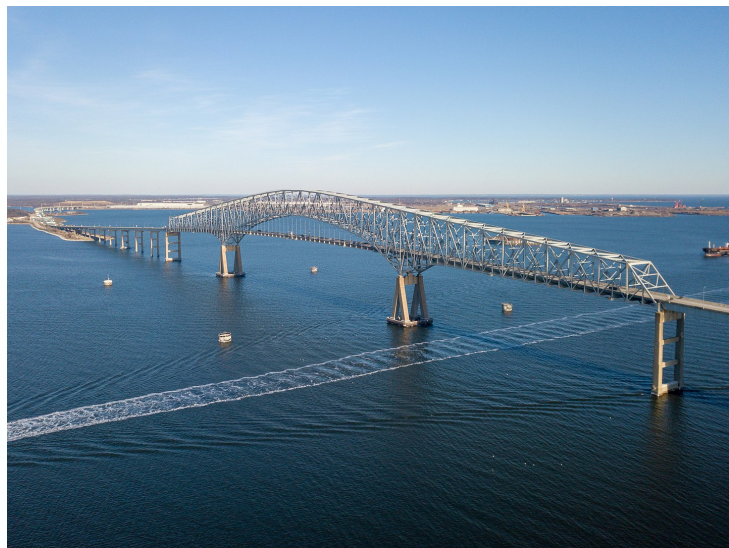
Francis Scott Key Bridge

HB1526: Maryland Protecting Opportunities and Regional Trade (PORT) Act: provides financial assistance for affected workers and companies, as well as scholarships for the children and spouses who unfortunately died during the collapse of the Francis Scott Key Bridge.