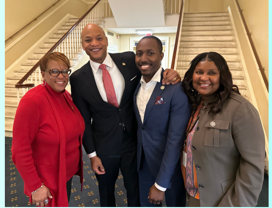
Governor Wes Moore and House Team 24