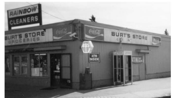
Photo taken by Norma Burt last year – from the middle of the intersection of Elbow Drive and 50th Avenue!

The store opened in October, 1946. Conveniences such as a hitching post for the riding customers, an ice cream bar, Calwin (Calgary/Windsor Park) Post Office, plus a general store was provided for the area. Initially, Norma, Austin and daughter, Bonnie, lived in the back of the store so they could remain open every day from 8:00 am to 10:00 pm and Sundays from 10:00 am to