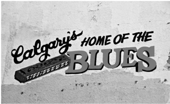
Sign formerly on the King Eddy