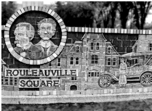
Rouleauville Sign 17th Avenue

Meet: Glenbow Main Lobby, 130 - 9 Avenue SE