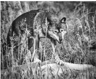
Wolf at Calgary Zoo Canadian Wilds

Meet: Details provided at time of registration