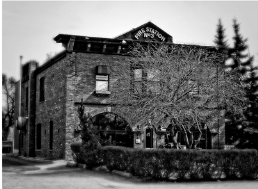
Fire Station No. 3

Meet: Central Library, Teen Area, 800 - 3 Street SE