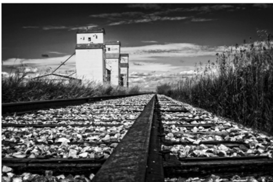
Mossleigh Elevators

Meet: Grain Academy and Museum, Stampede Park Plus 15 between the LRT and the BMO Centre