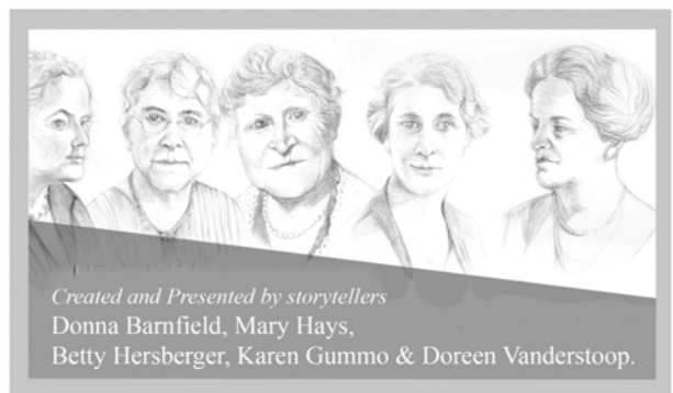
Graphic courtesy Karen Gummo

Meet: Central United Church, 131 - 7 Avenue SW