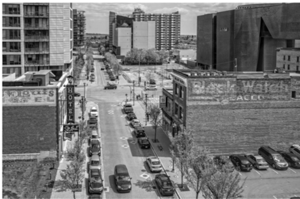
East Village from Central Library