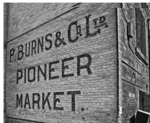
Pioneer Market back alley sign

Meet: MacKay and Dippie Block, 218 - 8 Avenue SW