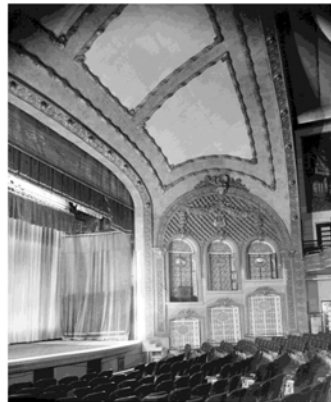
Sherman Grand Theatre