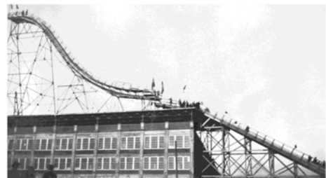
Ski jump on Stampede Grandstand

Meet: Memorial Park Library steps, 1221 - 2 Street SW