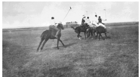
Polo Match

Meet: Ranch House on the grounds, Macleod Trail S to Hwy 552, turn right; Follow road for 10 km to 306 Avenue W, turn left; At stone gate on your right, turn right; Drive straight in, Ranch House is ahead. Map on calgarypoloclub.com website.