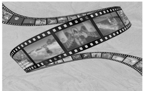
Movie Night at MPL

Look for the listing of movies that will be shown throughout HCW 2019 by our partner, Calgary Public Library at the historic Memorial Park Library. In the More Fun section on page 33 we have listed the movie titles. Please check the website calgarylibrary.ca for a full schedule of film titles and times. Also, look for the music offerings in the More Fun section.