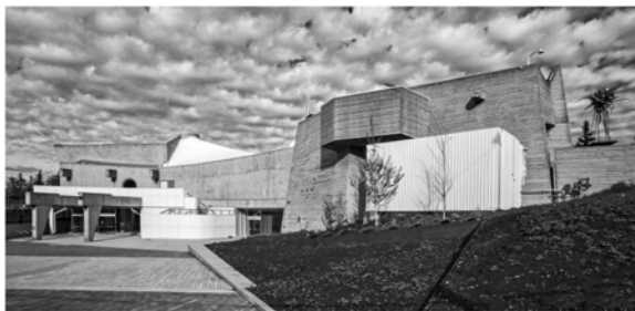
Planetarium being converted to Art Gallery