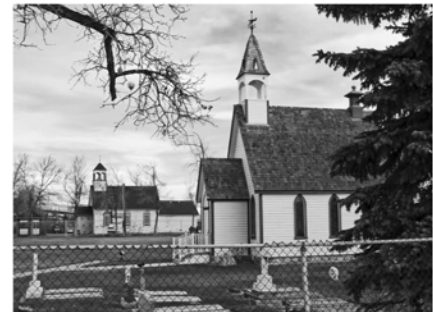
St. John Chrysostom Russian Church (left) and St. Paul's Anglican Church (right), Midnapore

Meet: South side of Historic St. Paul's Anglican Church 14620 Macleod Trail SE (Access from Bannister Road and 146 Avenue SE)