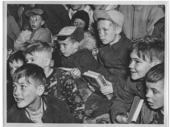
Rapt attention during storytime

Meet: Central Library, Level 2 Adult Open Space 2 800 - 3 Street SE