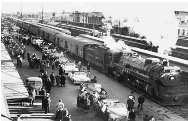
Calgary Stampeders returning from Grey Cup 1949