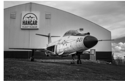
Hangar Flight Museum CF-101

Meet: The Hangar Flight Museum, 4629 McCall Way NE