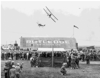
Airshow Renfrew Airport ca 1920s Courtesy Glenbow Archives NA-3691-32

Meet: Renfrew Community Association 811 Radford Road NE