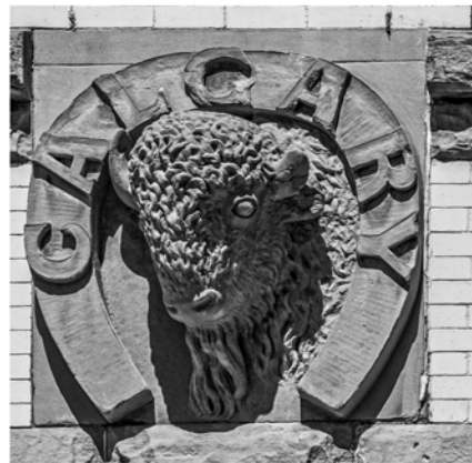
Calgary Brewing and Malting Company Symbol

Meet: 1543 - 17 Avenue SE the arch outside of ZYN The Wine Market