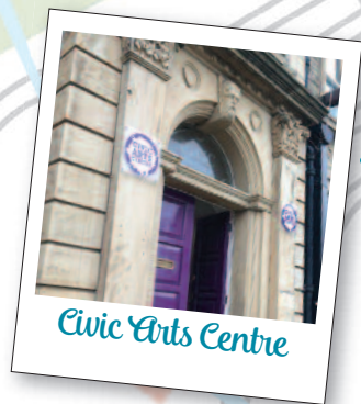
Civic Arts Centre