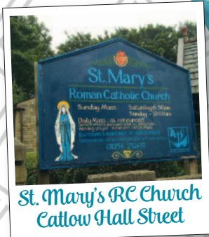
St. Mary's RC Church Cattow Hall Street