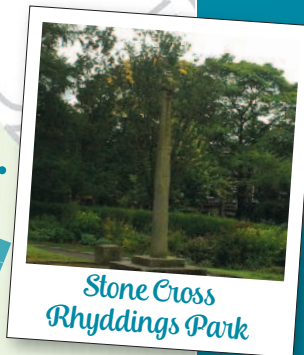
Stone Cross Rhyddings Park