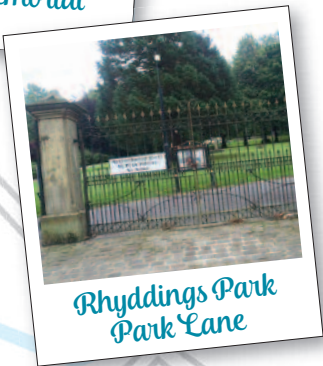
Rhyddings Park Park Lane