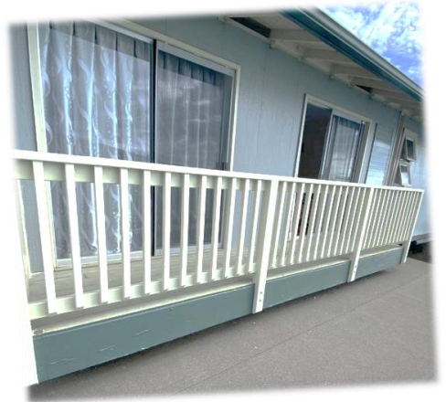
Example of approved railing design.

See the resident manager for specifications for the approved balcony / deck railing design. Ropes are no longer allowed on Koko Isle railings as they do not conform to current Building Codes and therefore should be replaced. The Resident Manager and Building & Grounds Committee will inspect all railings and advise residents of those not in compliance. Also, inspect all trees and vegetation in your privacy areas that need trimming away from or removal from the building for painting.