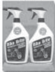
BIKE BRITE $8.95