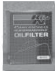
K&N OIL FILTER $11.95 $11.95