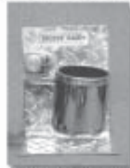
KRUZER KADDY $29.95