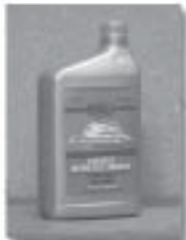
HD SYN 3 $9.95