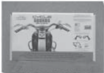
CYCLE SOUNDS $349.00