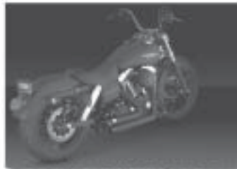
BLACK EXHAUSTS ARE IN STOCK!