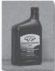
BIKERS OIL $2.99