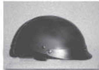
DOT HELMETS $299.5