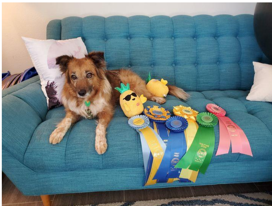
Also at Silver Bay, Helper earned her PCDX! She also came in first place, high scoring all American, and high preferred!