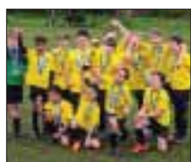
Gold Cup winners, Wandle Thunder celebrate their triumph

THE sun was out on cup final day. Up first was the Bronze Cup final between Beddington Cyclones and Grange Lightning.