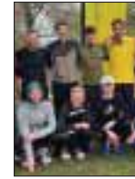
HERCULES Wimbledon Athletic Club saw record performances as two teams headed up to Sutton Coldfield for the annual English Road Running Association Men's 12 Stage

Road Relay Championships held in Sutton Park this Saturday.