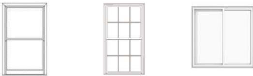
Non-bar single or double hung window Colonial style single or double hung window Non-Bar style sliding window