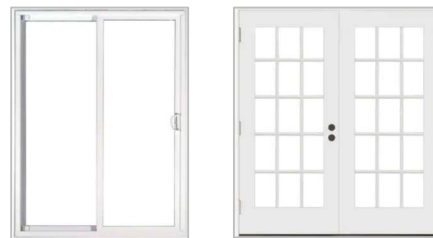
Sliding Patio Door (Non-Bar or Colonial Style) Double Hung Patio Door (Non-Bar or Colonial Style)