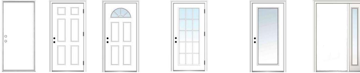
Flush panel door Six panel door Sunburst four panel door Full-lite glass door “White frosted glass” colonial style Full-lite glass door “White frosted glass” Glass sidelite (combined with any of these doors)