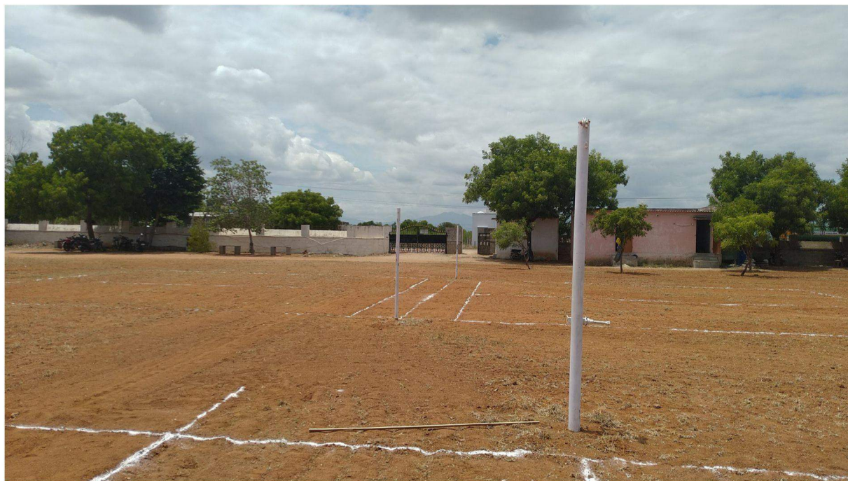
East side of the school campus