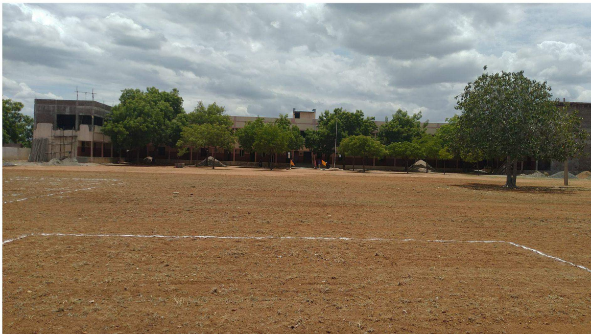
North side of the school campus