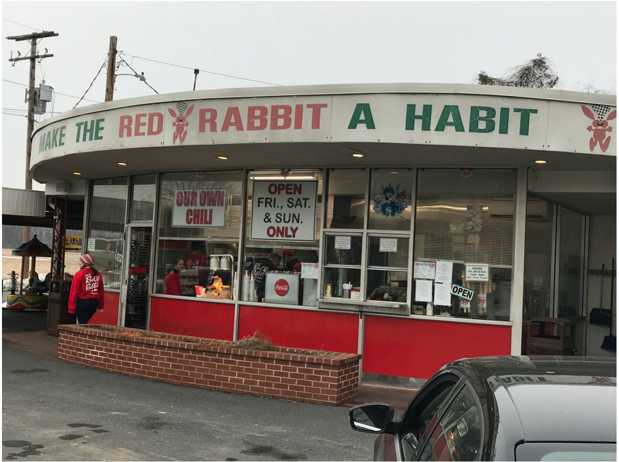
(Red Rabbit Drive In, 2019)